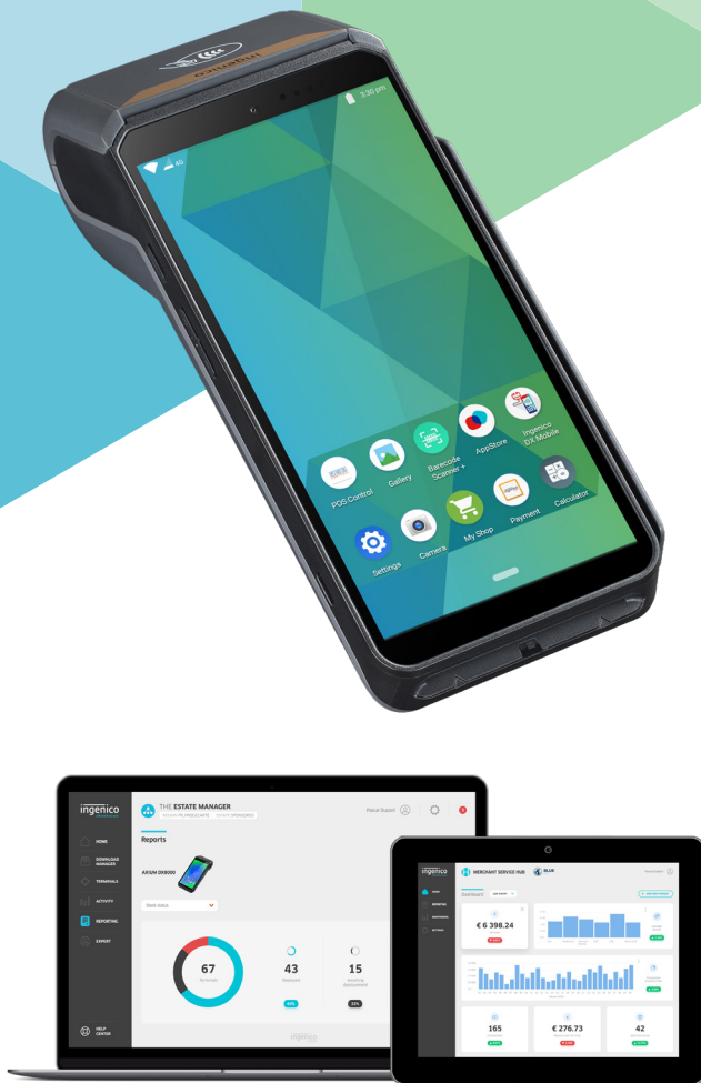
The AXIUM DX8000 is supported by our Cloud Services

AXIUM DX8000 is compatible with Ingenico's suite of services, from fleet management to merchant business services such as e-receipt management and business reporting.