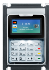
Self/8000 Artema Form Factor