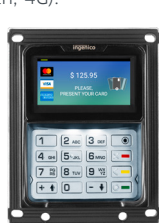
Self/8000 EVA Form Factor

The Self/7000 can be used in a card reader-only configuration for scenarios that do not require a PIN pad. The modular design provides the flexibility needed for self-service.