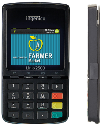
The Link/2500 Companion is supported by our Cloud Services