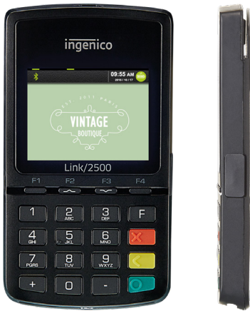
The Link/2500 Integration is supported by our Cloud Services