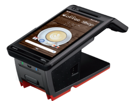
AXIUM D7 + AXIUM DOCK