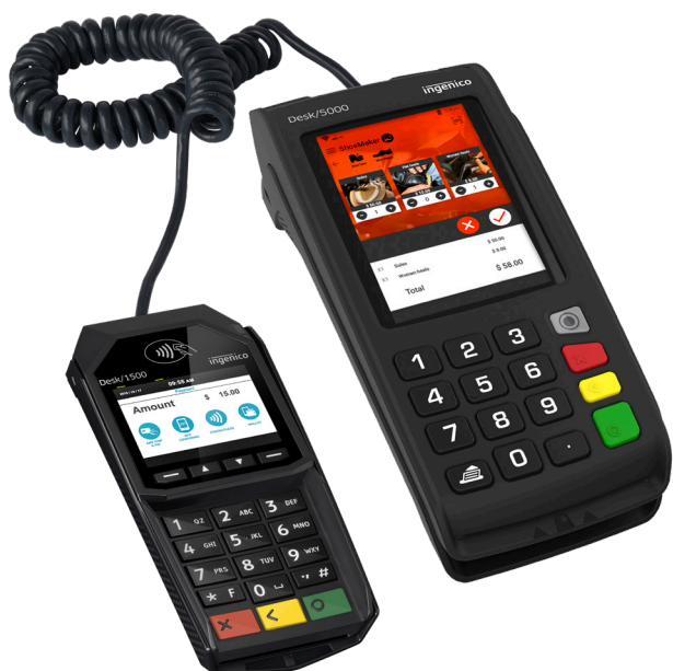
The Desk/1500 is supported by our Cloud Services