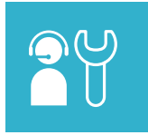
On-site or remote technical support