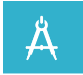
Payment solution architecture