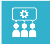
Payment technology consulting

Ingenico is your go-to partner, whether you're adopting a new payment technology, upgrading your existing installations or addressing certification, compliance and security requirements.