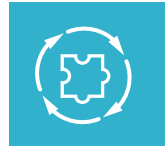
Integration, implementation and support