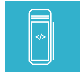
Software and hardware development