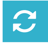
Solution update / renewal